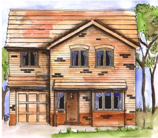
The Kirklington K/2002