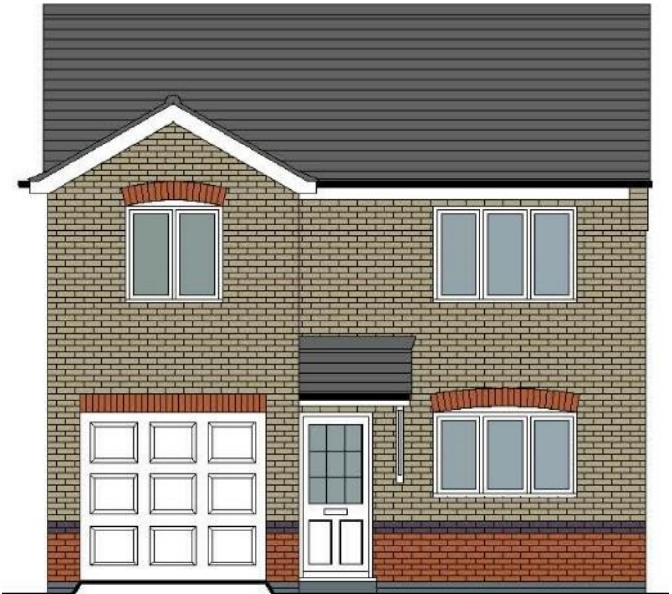
(Typical Front Elevation)