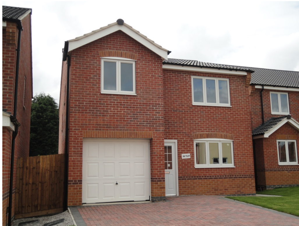
Picture shows a typical C7AB - Cambridge