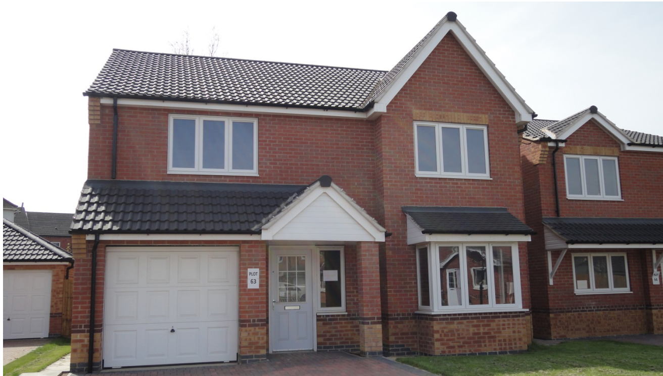
Picture shows a typical E20 - Easton