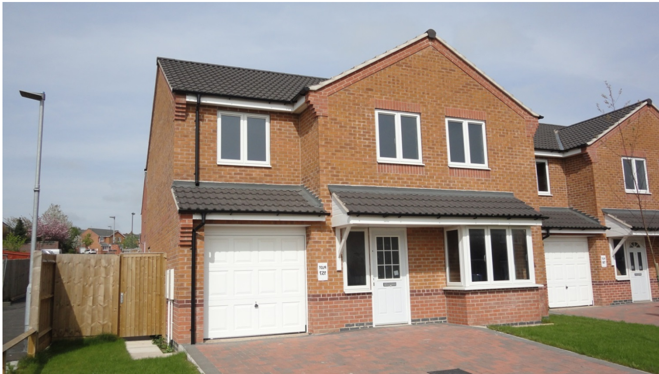
Picture shows a typical Ka - Kensington