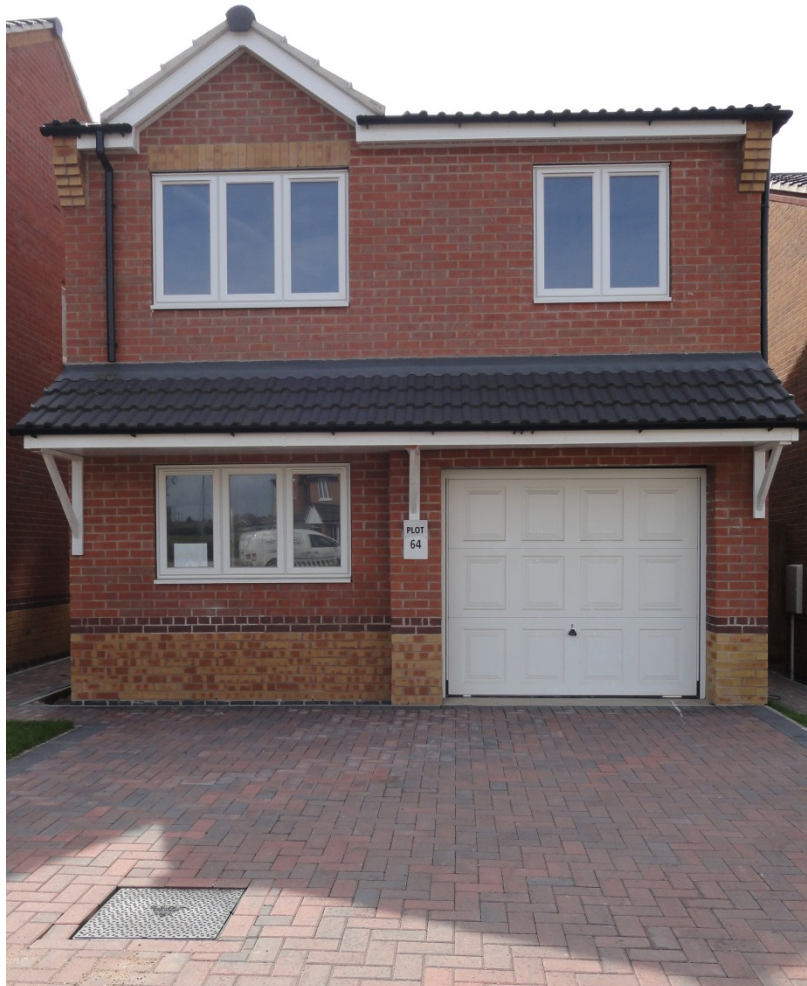
Picture shows a typical DA - Dorchester