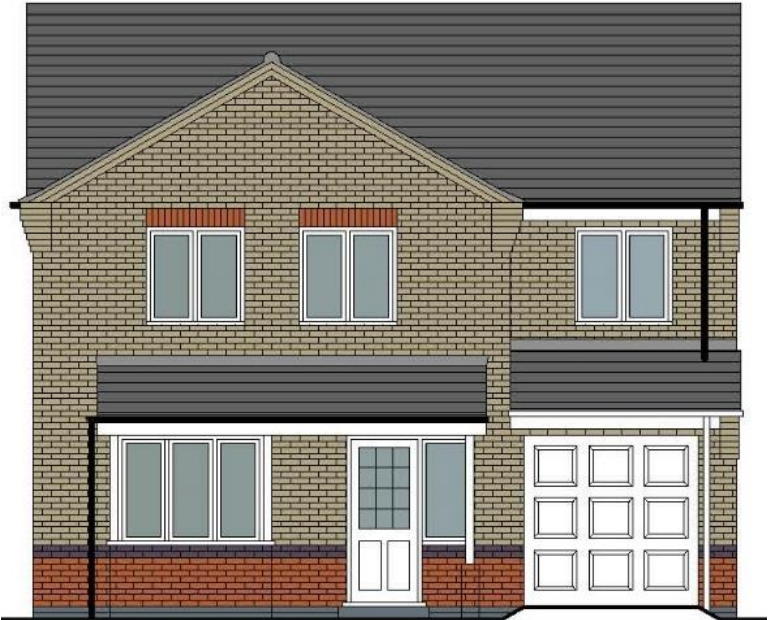
(Typical Front Elevation)