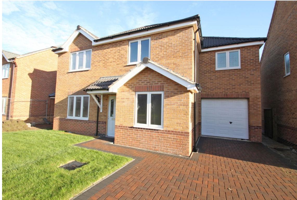
Picture shows a typical B5 - Beckley