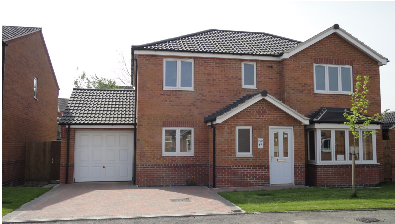
Picture shows a typical F3 - Fairbanks