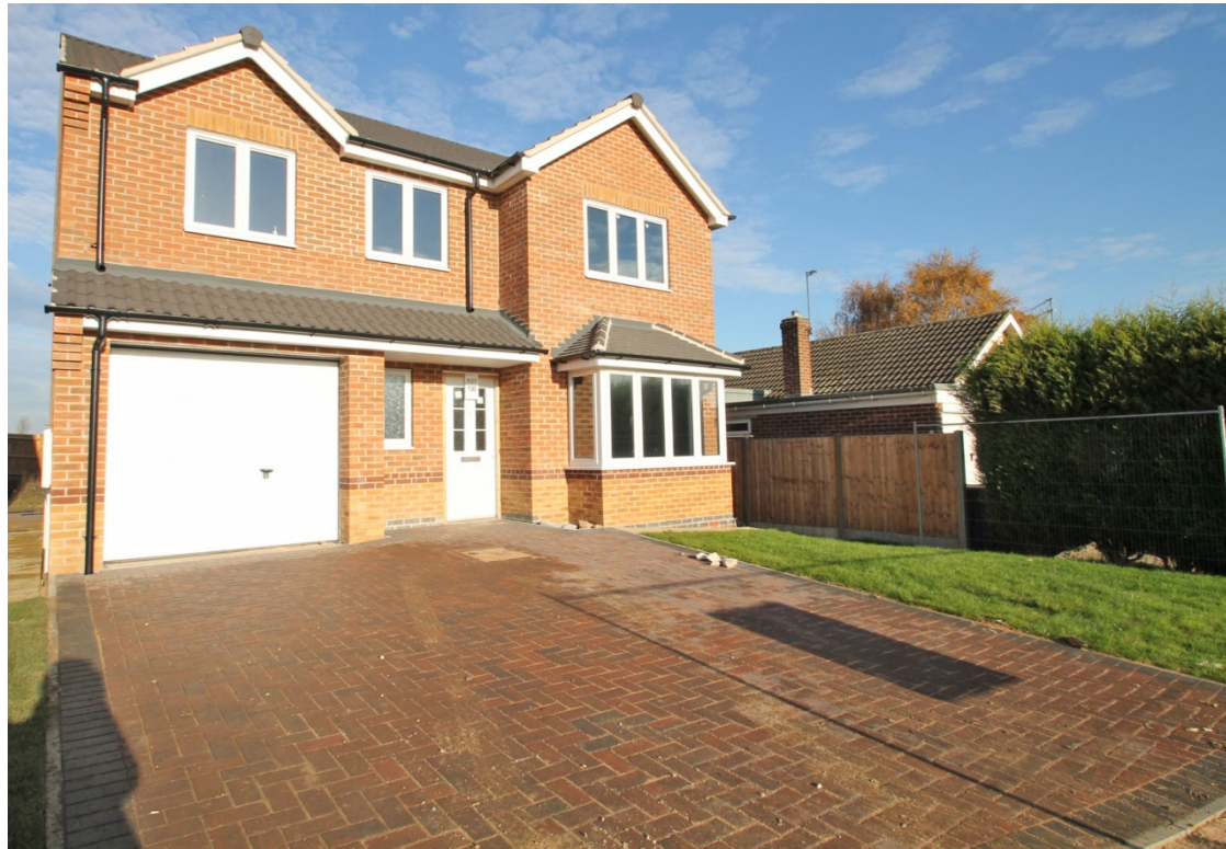
Picture shows a typical T20 - Turton