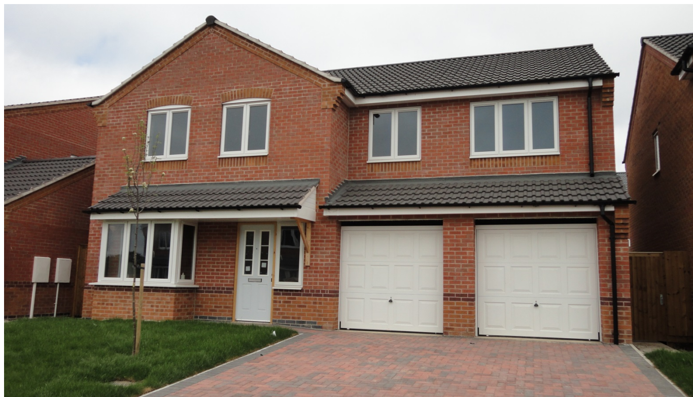
Picture shows a typical K6a - Kentwood