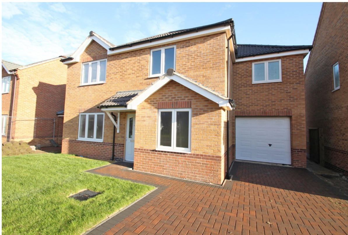
Picture shows a typical B5 - Beckley