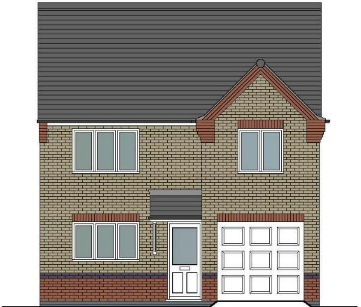
(Typical Front Elevation)