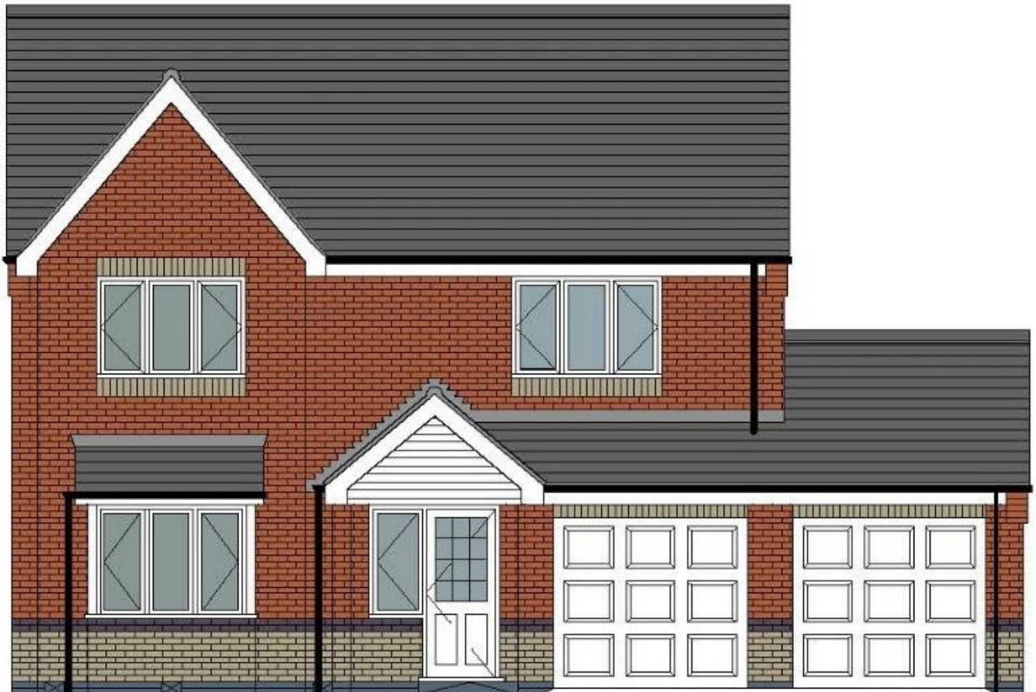
(Typical Front Elevation)