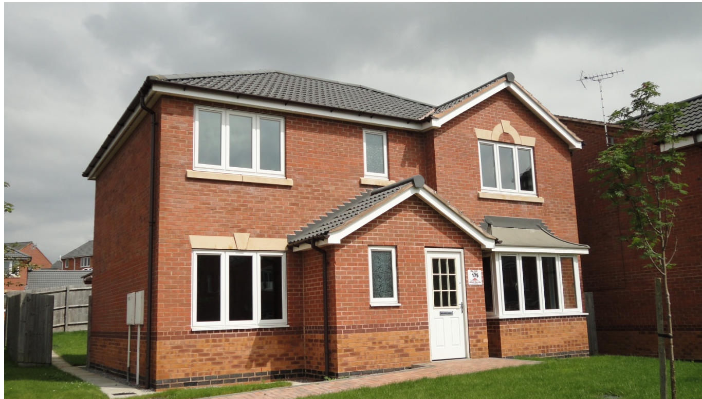
Picture shows a typical F3 - Fairbanks