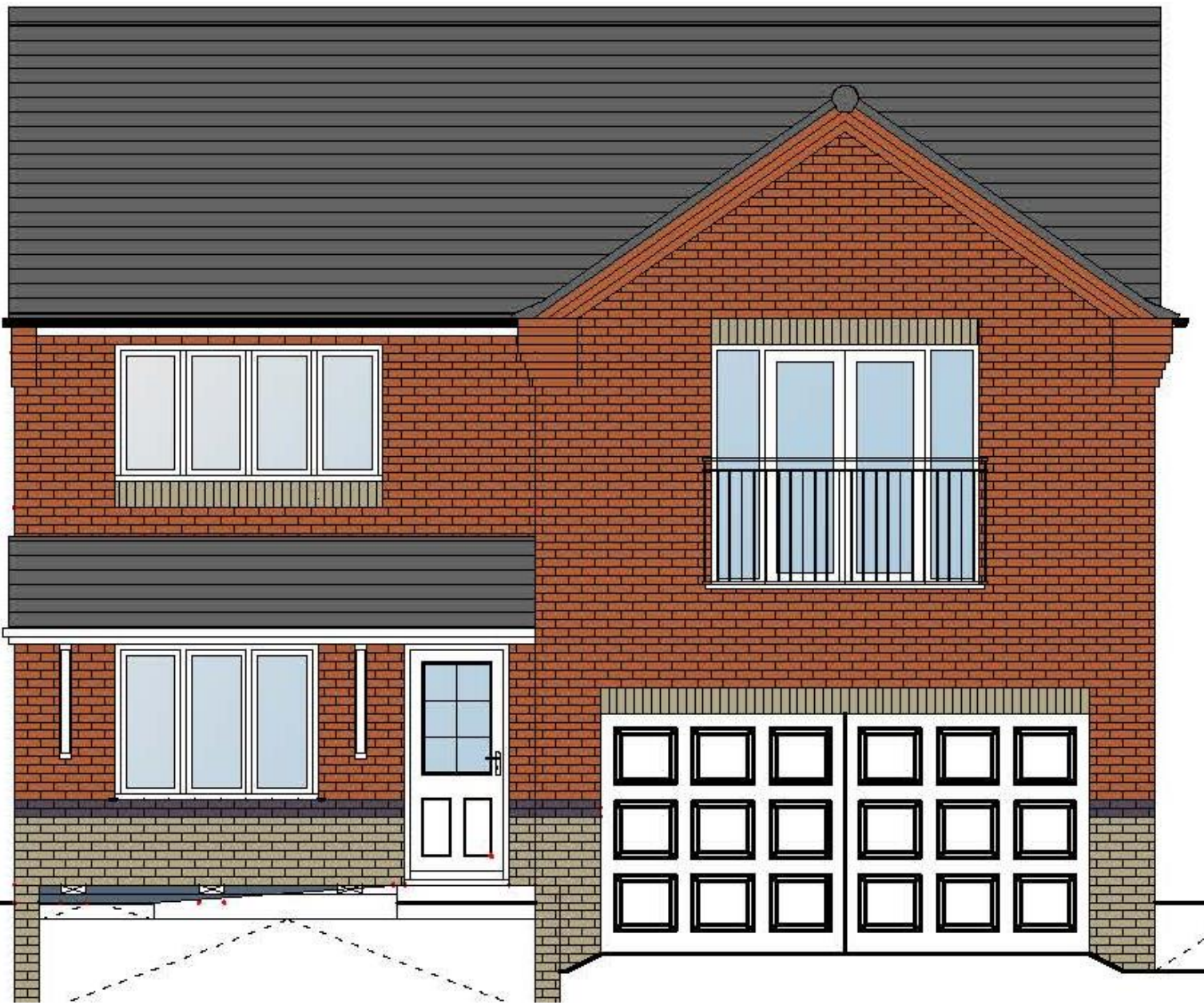
(Typical Front Elevation)