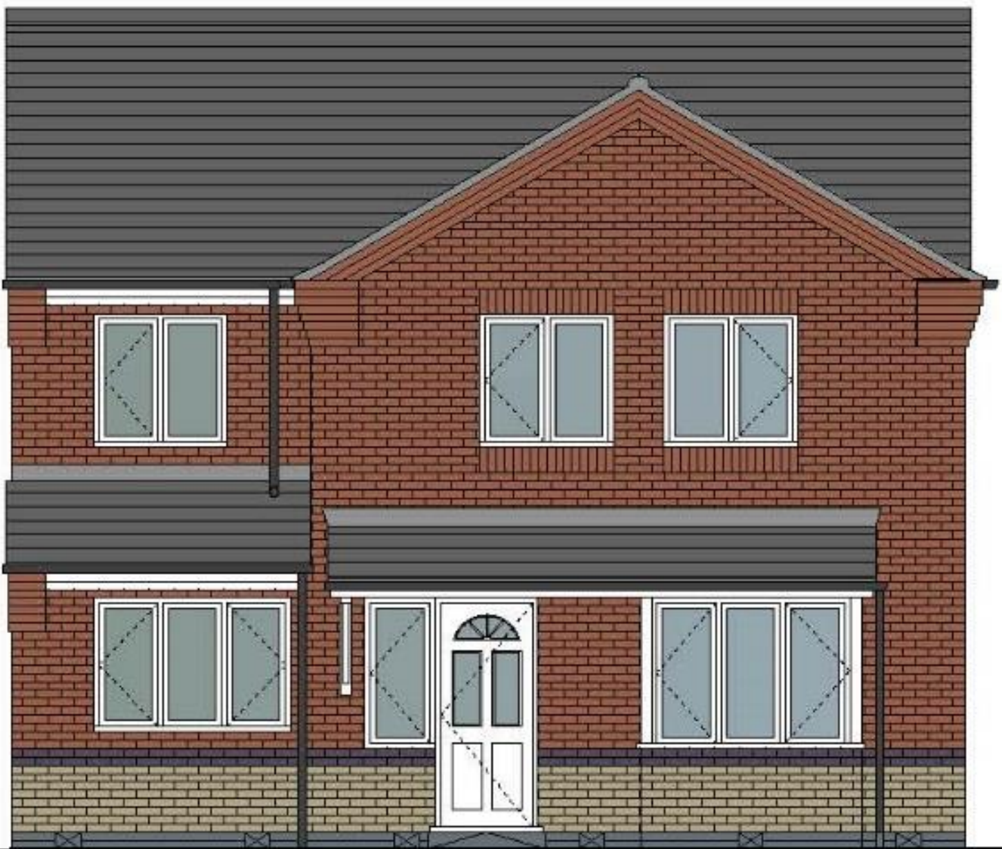
(Typical Front Elevation)