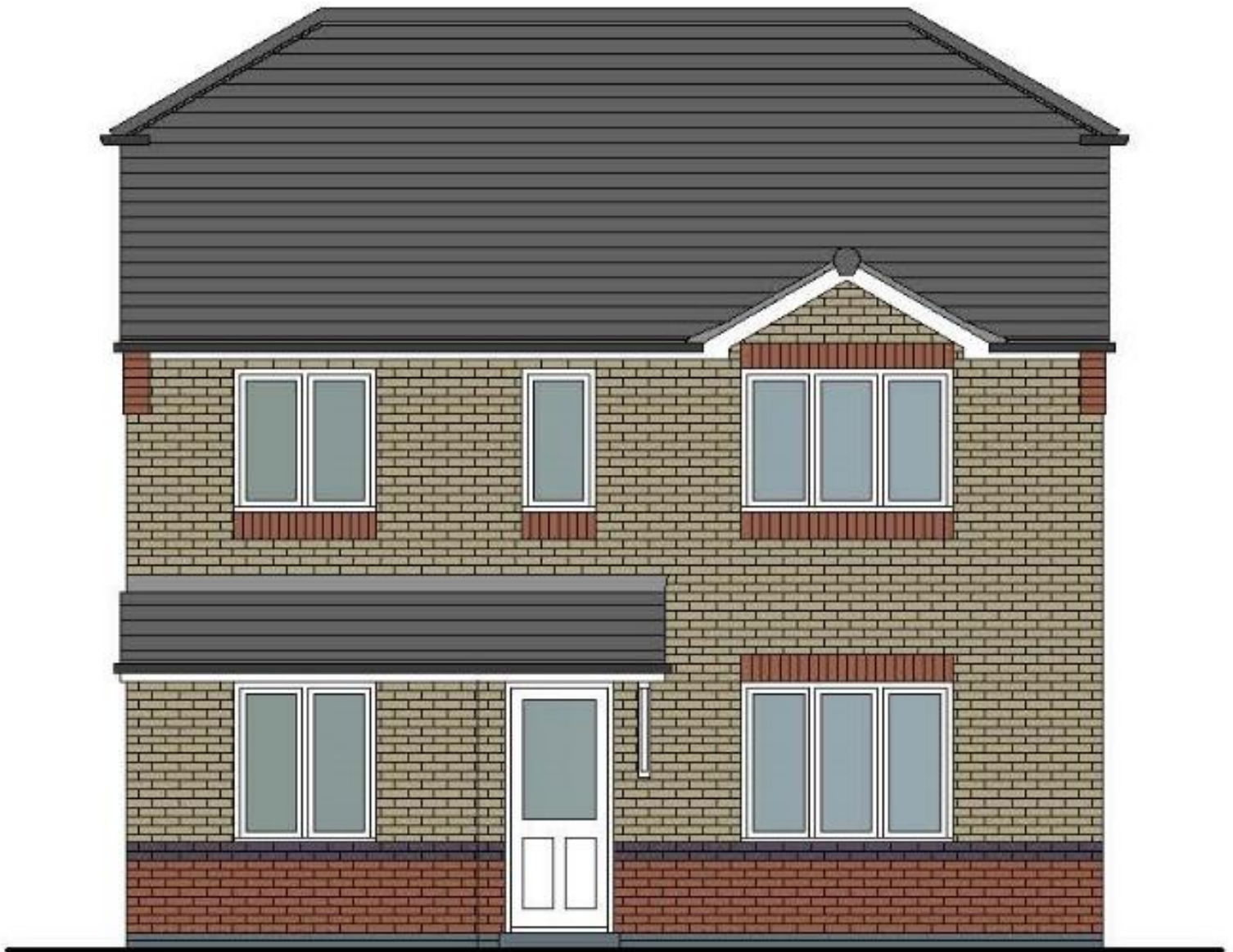
(Typical Front Elevation)