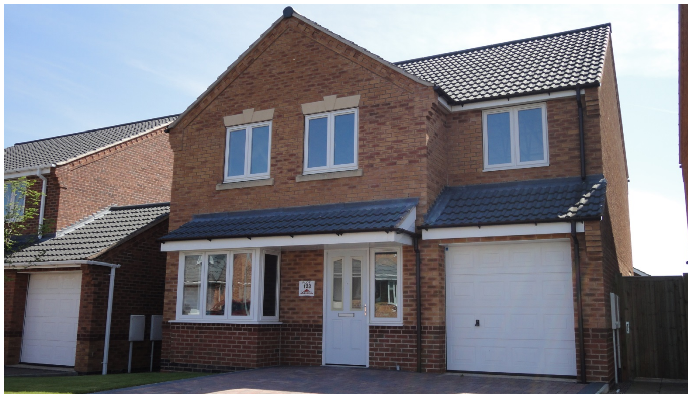
Picture shows a typical Ka2 - Kirkby