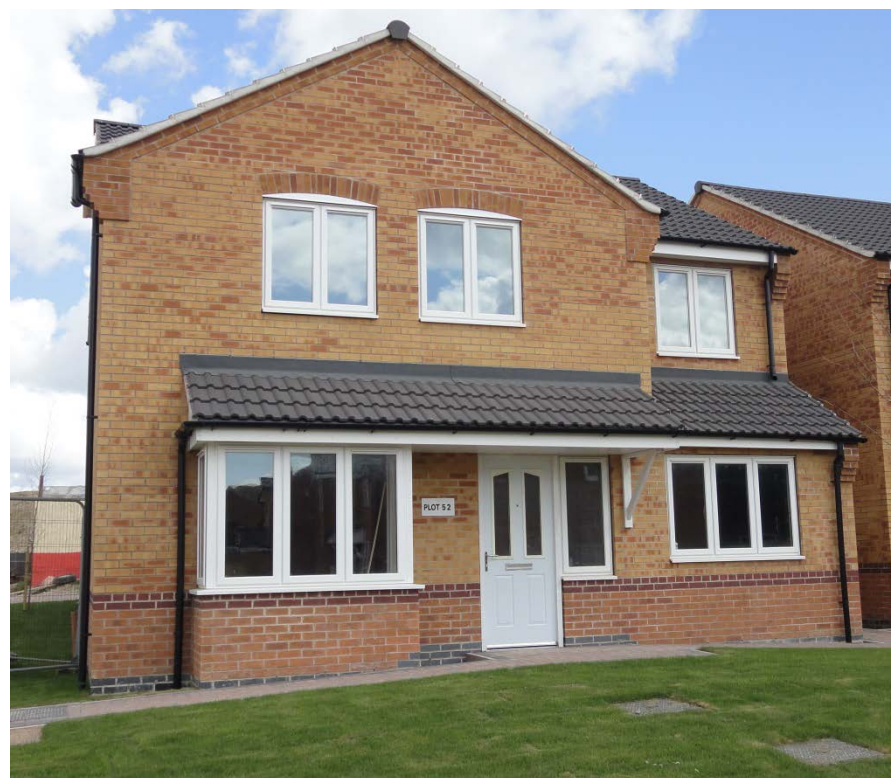
Picture shows a typical N2 - Newbury