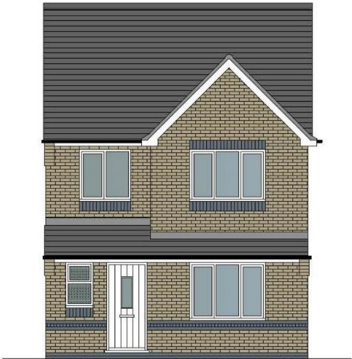
(Typical Front Elevation)