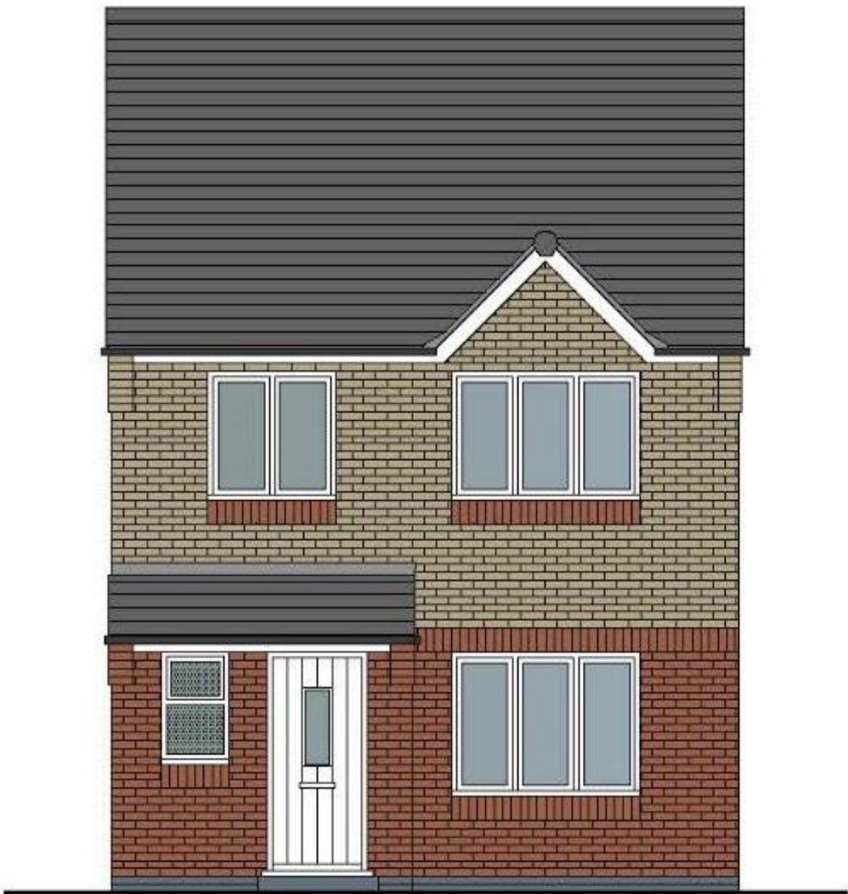
(Typical Front Elevation)