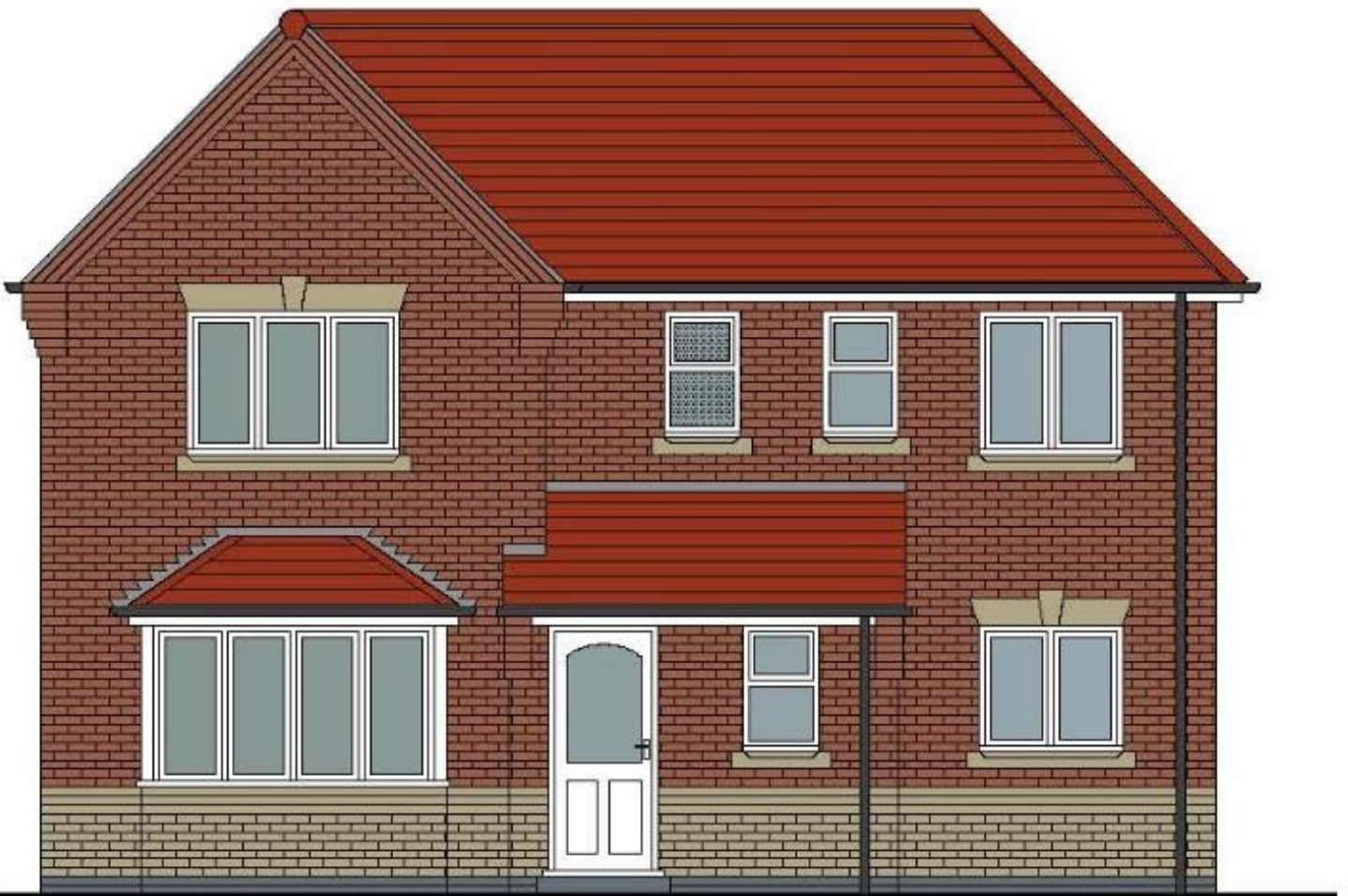
(Typical Front Elevation)