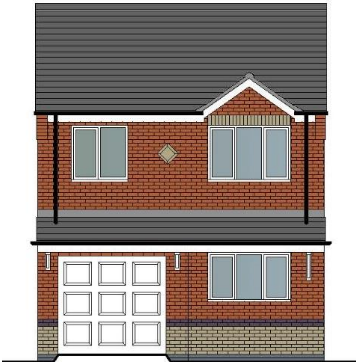
(Typical Front Elevation)